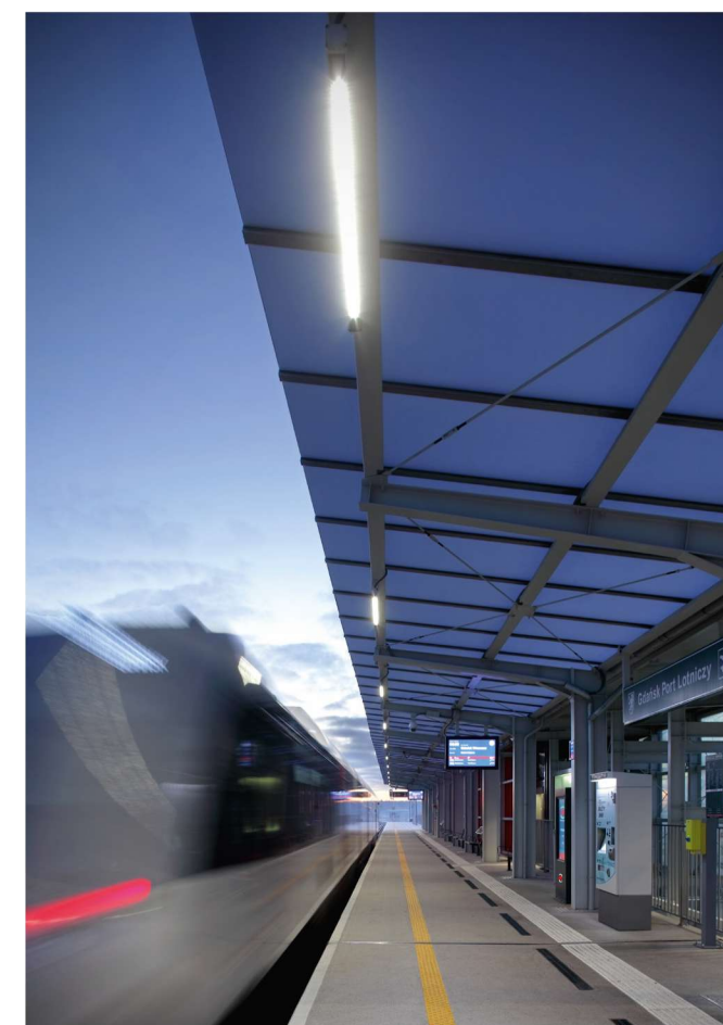
Pomeranian Metropolitan Railway (Poland)