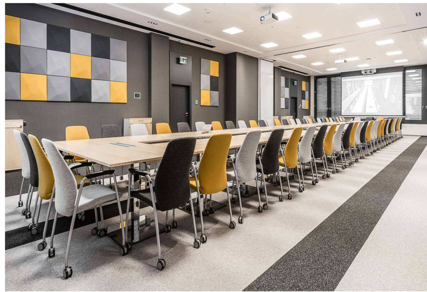
In co-operation with Kinmarps Company (Gdańsk, Poland)