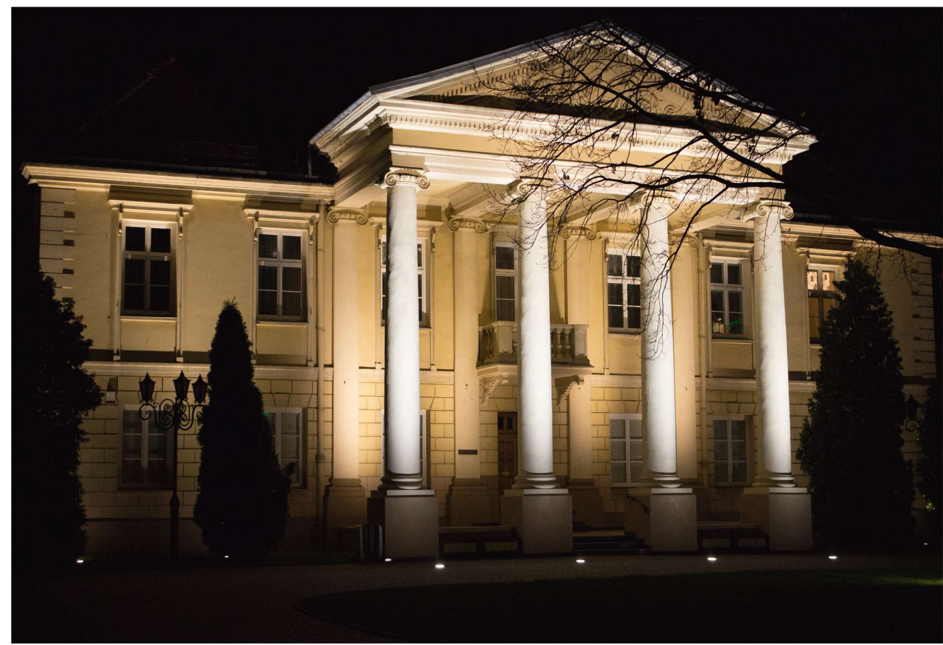
REVA CRU AS 12 (12LED - 17W)