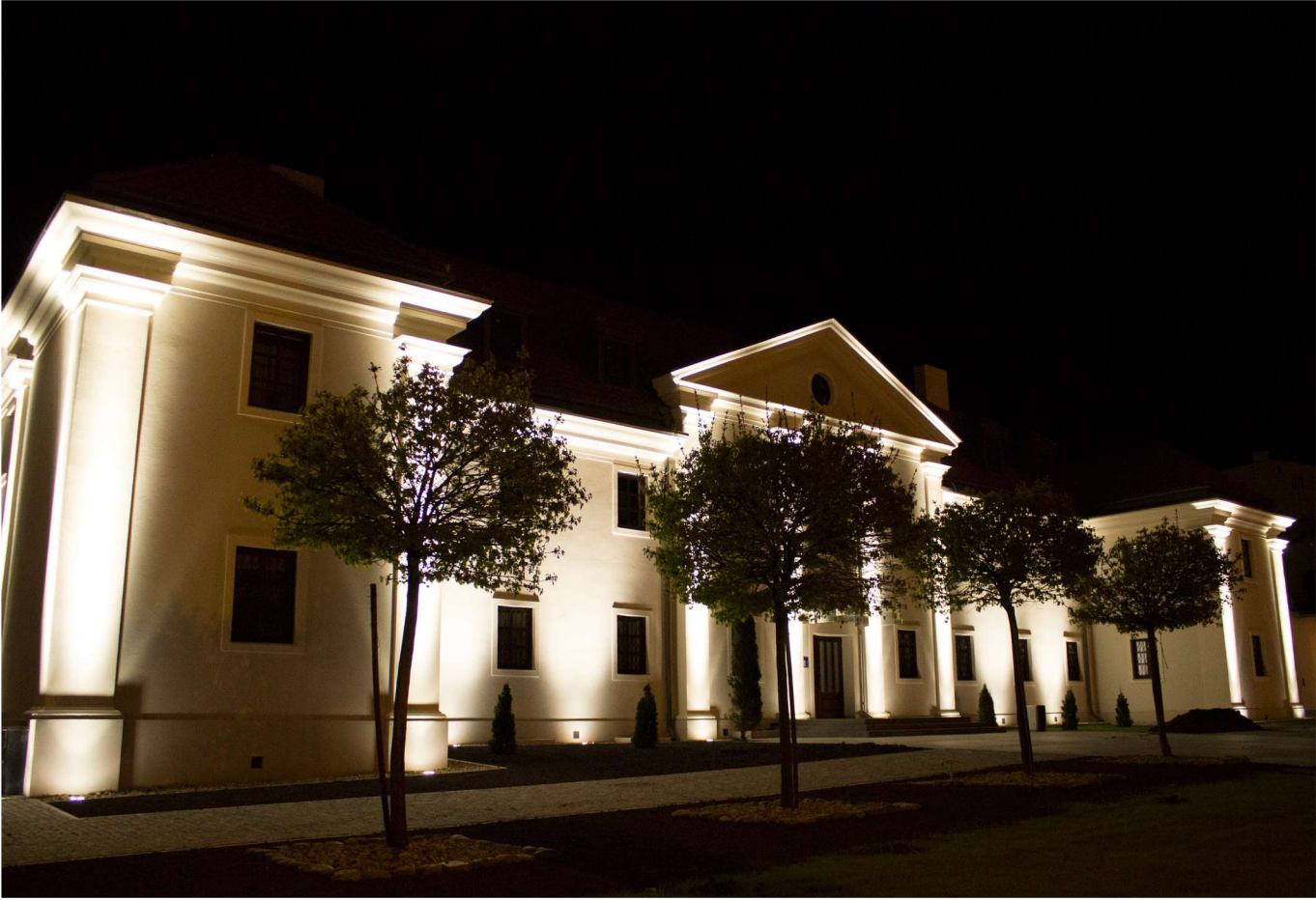
REVA CRU AS 36 (36LED - 46W)